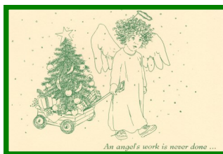
The Littlest Angel