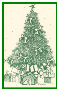
The Christmas Tree

The selling of cards is our only fundraising effort, and enables us to purchase food for our food cupboards and soup kitchens. The extent to which we are able to help those in need depends solely on the generosity and assistance of people like you. With the increase of more and more people in need of food each day, this annual fundraiser is more important than ever.