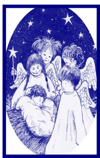
Child of Wonder