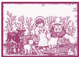
The Little Child of Peace