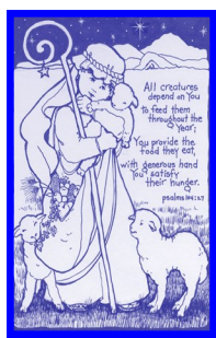
The Lamb of God