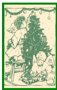
Angels Decorating The Tree