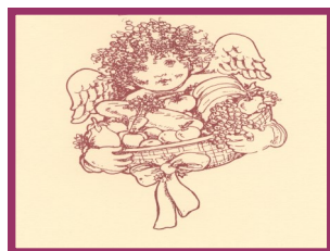
Angel of Bounty